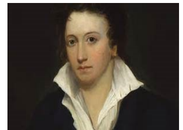
Percy Bysshe Shelley